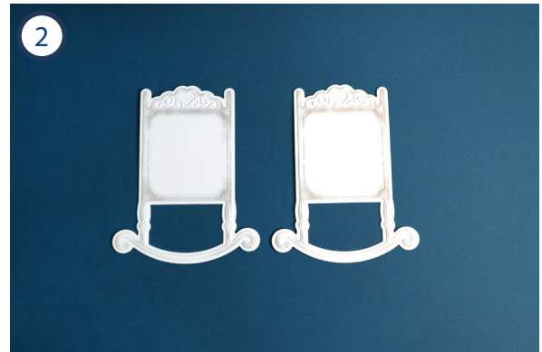
2 Stick the headboard pieces together, with a detailed piece either side of each mat.