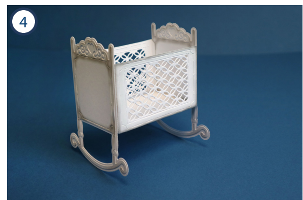
4 Stick the bottom into the Crib to finish, using the tabs either end and sticking them to the insides of the headboards.