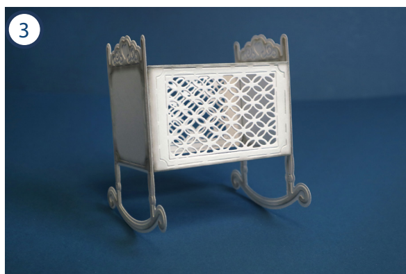
3 Using the tabs either end, stick the sides between the headboards as shown.