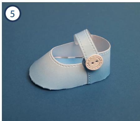
5 Stick the button onto the strap to finish.