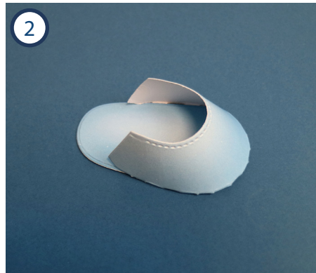
2 Form the toe by folding in the tabs of the arched piece. Stick onto the sole of the shoe.