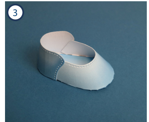
3 Stick the heel onto the shoe and secure using the tabs on the bottom.