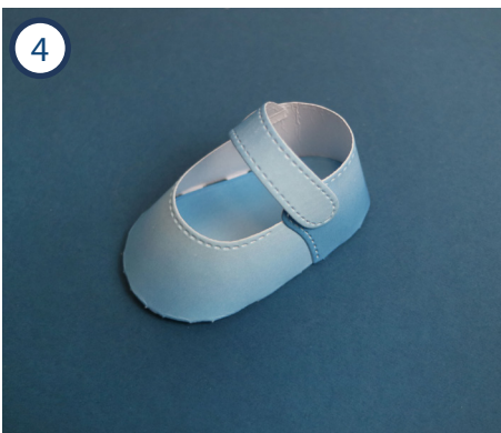
4 Bend the strap around the shoe and secure on either side. Tip - use hook and loop on the thinner end to allow the shoe to open and fasten if desired.