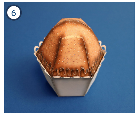
6 Stick the cake top into the cup using the bottom tabs.