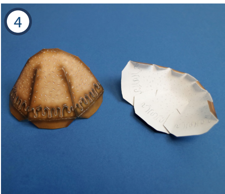
4 Assemble the cake tops by sticking the tabs to their corresponding sides. Fold down the free tabs along the long edge.