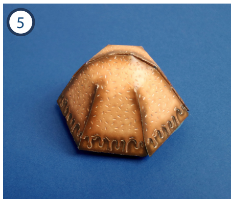
5 Stick the cake tops together, sticking the free tabs to their mirrored tab.