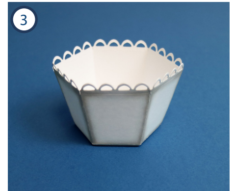
3 Stick the two halves of the cup together by overlapping the bases and securing the two side tabs onto their opposing sides.