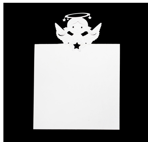
3. Run through the die cutting machine, remove the die and fold the card. The die cut shape will be over the edge of the card.