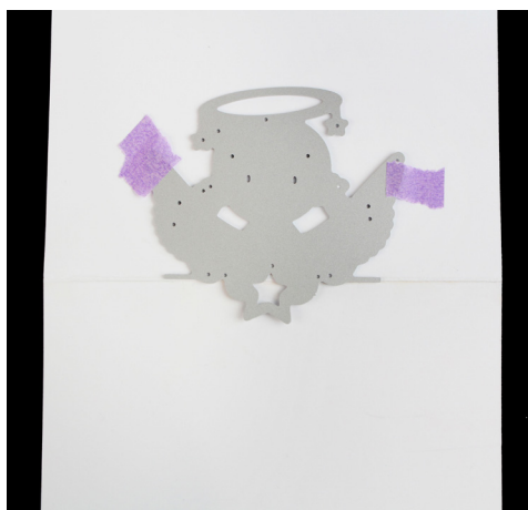
2. Open the card and place the die on the fold line, hold the die in place with low tack tape to prevent it from slipping.