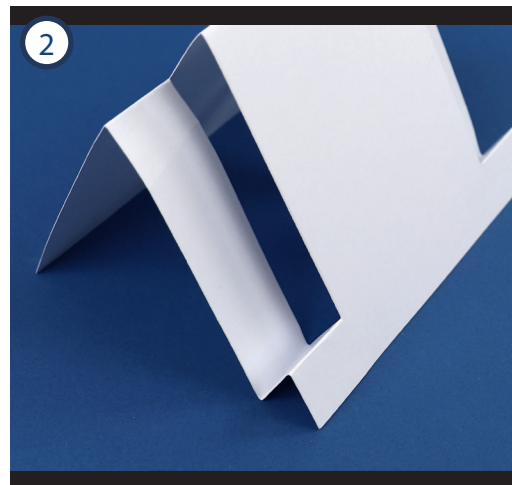
2. Mountain fold the die cut in half and alternate mountain and valley folds on the edge score lines as shown.