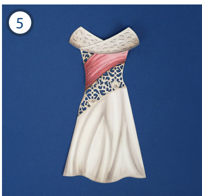
5 Stick the collar onto the Dress. Add embellishments as desired.