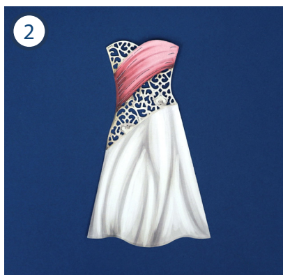
2 Stick the skirt and bodice together.