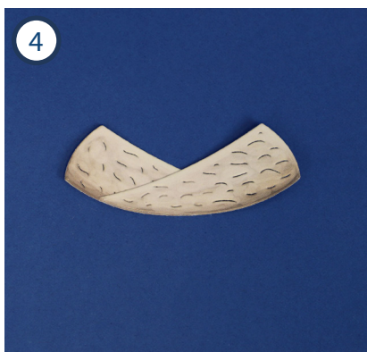
4 Stick the fur collar pieces together, overlapping the pointed ends as shown.