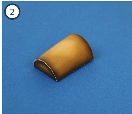
2 Assemble the pot by bending the largest section and sticking the side tab onto the back. Fold up the base and secure with the small tab.