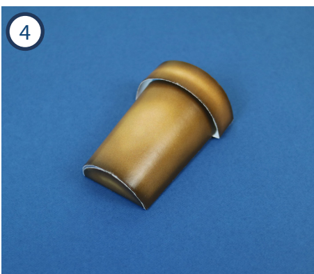
4 Stick the rim onto the pot to complete.