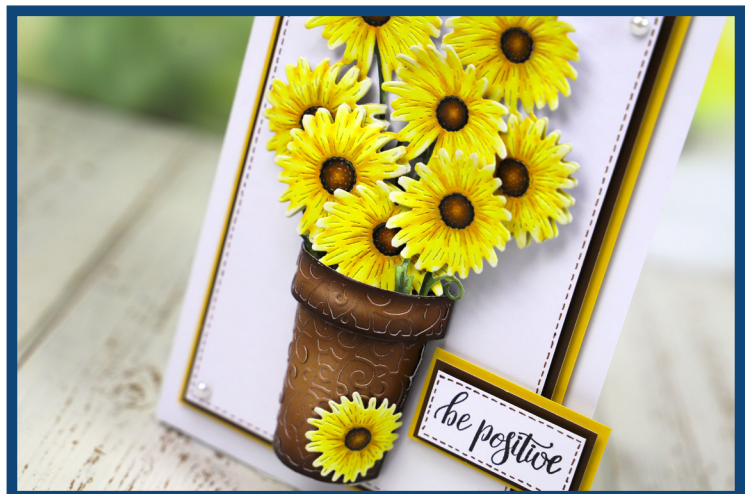
Use the Sensational Flowers die set to decorate and fill your flower pot!