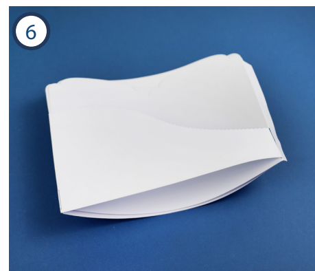
6 Attach the first sloped section on the card, using the tab of the higher end and slotting the end of the slope into the corresponding slit.