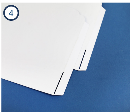
4 Use the larger slit die to cut slits into the large sections of the card.