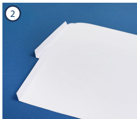
2 Score and fold the tabs on the large card sections.