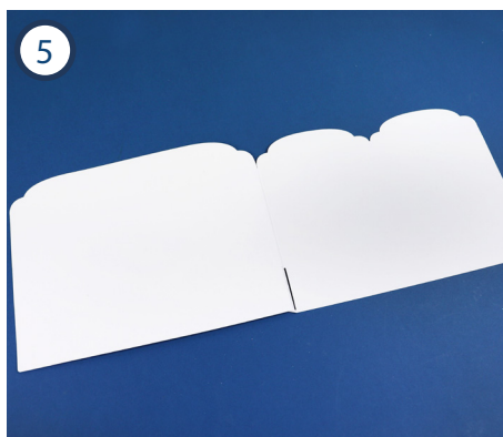
5 Use the tabs of the large sections to stick them together.