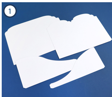
1 Cut out the pieces as shown.