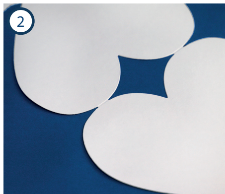
2 Score between the card halves as shown.