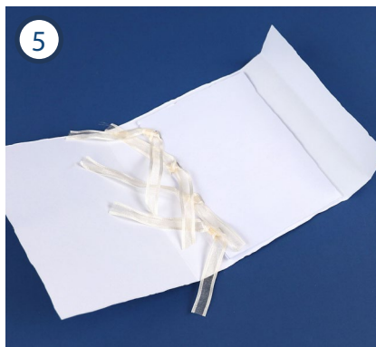
5. Mat the pages in the journal along the ribbon edge.