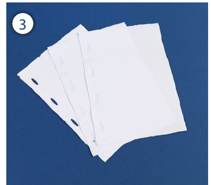
3. To create pages for your journal cut several of the largest rectangle mats with the ribbon hole dies.