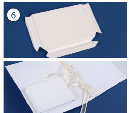
6. To create a gusset or large pocket cut the shown die and accordion fold along the edges. Secure to your journal using the three tabs.