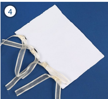
4. Thread ribbon through the holes and tighten to secure the pages together.