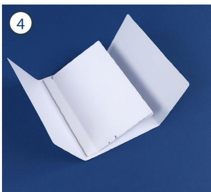
4. Mat together inside the wallet.