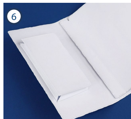
6. Using the tabs secure the pocket inside the wallet.