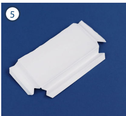
5. To create a large pocket cut the shown die and accordion fold down the edges.