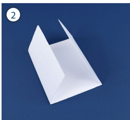
2. Valley fold along the two double lines.