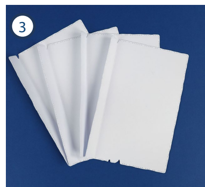
3. To create pages/flaps cut several of the largest rectangle die and score down the sides.