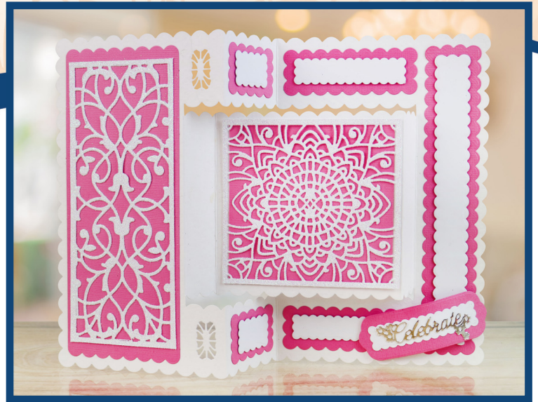
Decorative Tri-fold Card